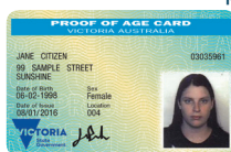
Proof of age card