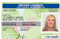
Australian driver licence