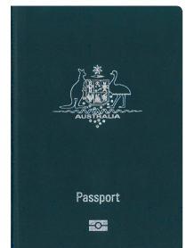
Australian or foreign passport