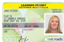
Victorian learner permit